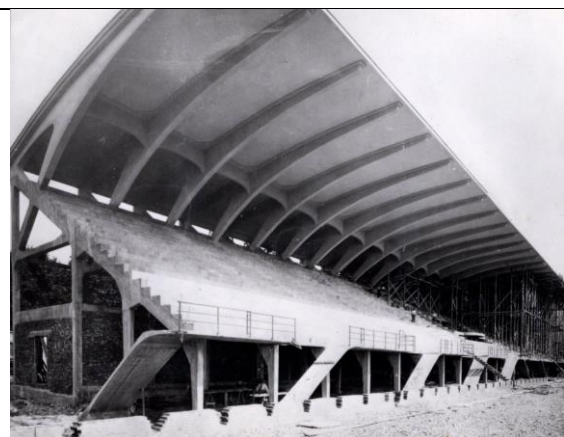
The grandstand under construction, unknown photographer, 1930.